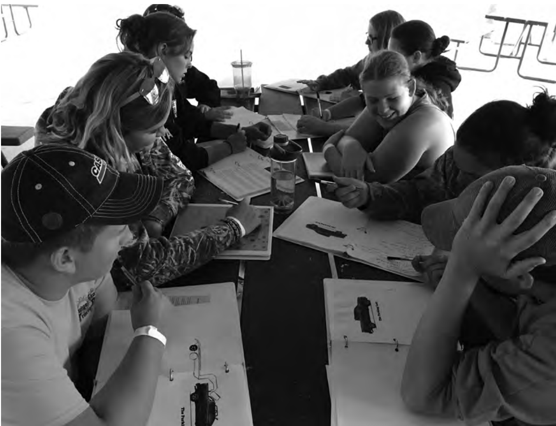
FFA members work together on team building