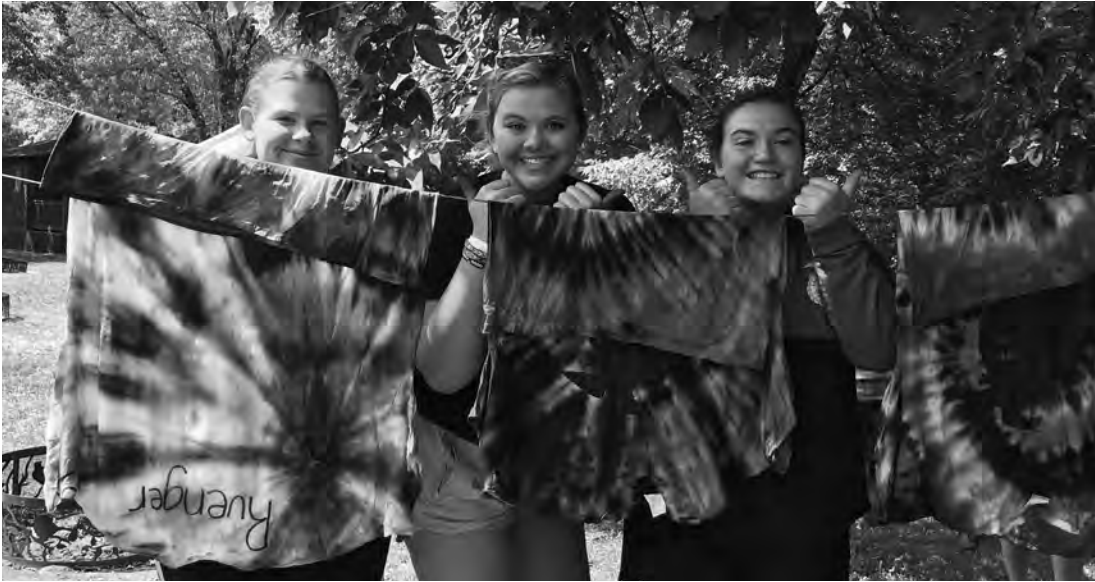
Fun can build teams, too, as these FFA members demonstrate with their tie-dyed shirts!