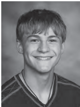
Top Tapplin 1st Team 4x200