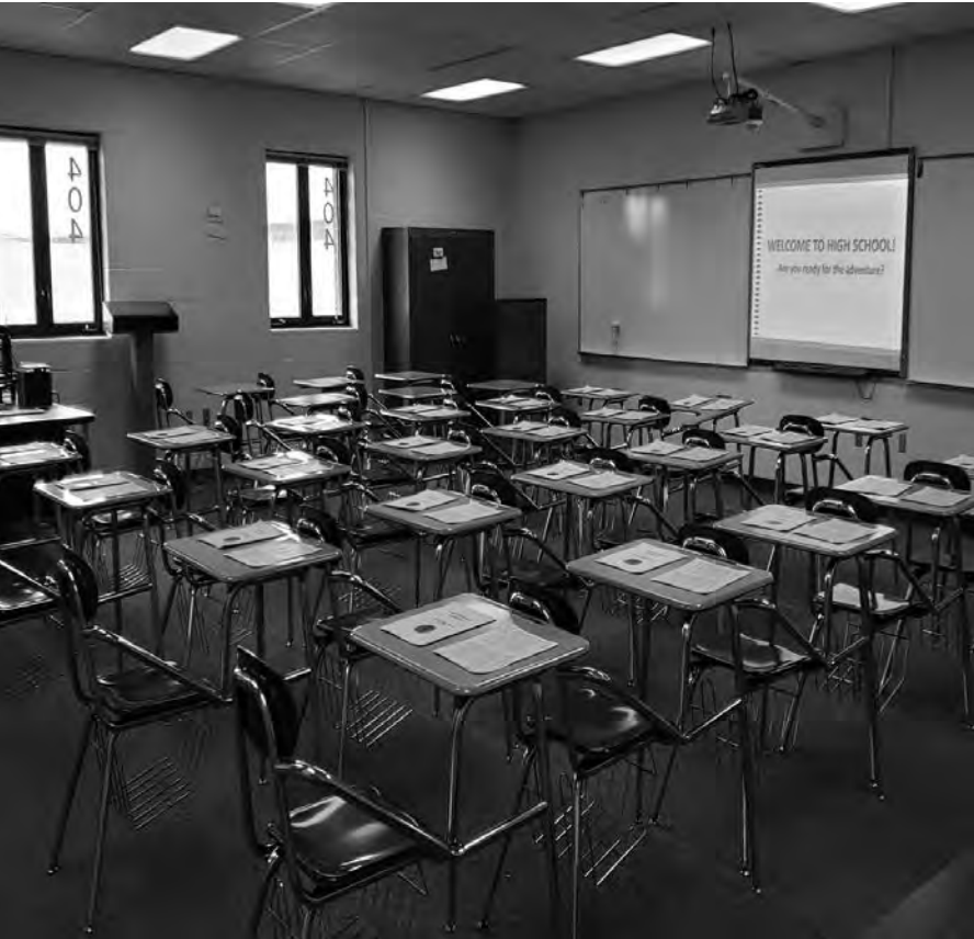
The room is set for incoming freshmen to learn all about high school at the Freshman Transition Program held in mid August.