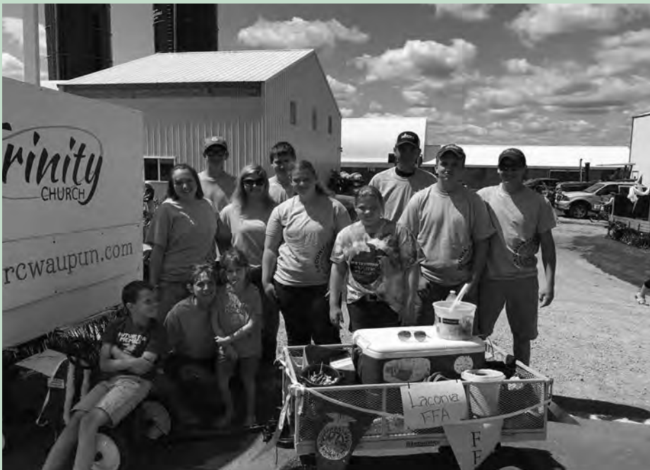
Laconia FFA Officers and a few little helpers are ready for the Alto Fair Parade.