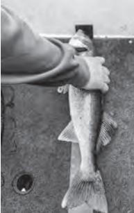
Both ice fishing and regular are popular options.