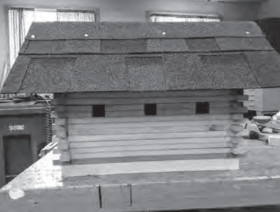
Woods projects, especially projects involving wildlife are great choices for SAE projects. Our Laconia kids make some impressive bird houses.