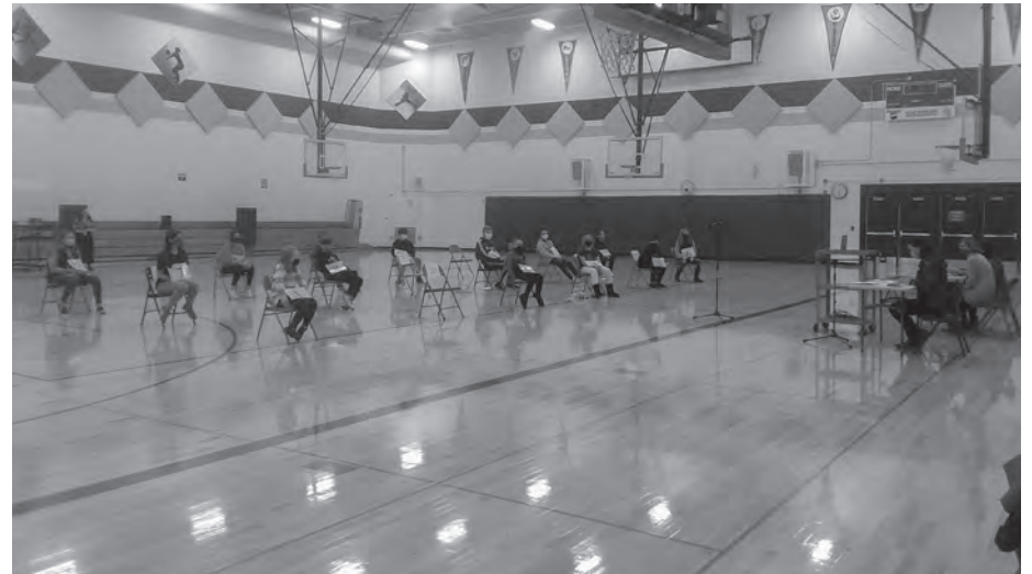
Rosendale Intermediate students compete in the Rosendale School Spelling Bee.