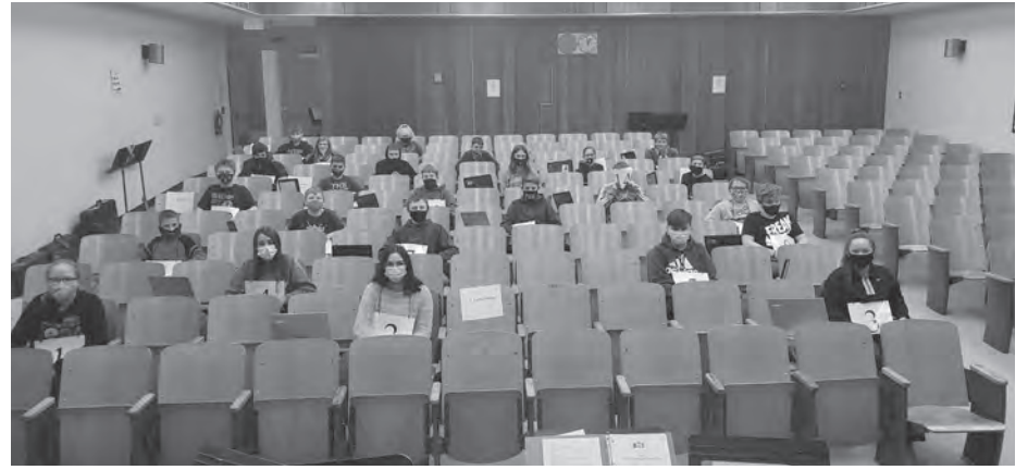
Brandon students compete in the Brandon School Spelling Bee.