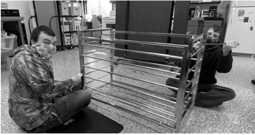
Seniors Ryley Blank and Dale Frye assemble basketball cages for use at the middle school.

Ryley Blank and Dale Frye, students at LHS volunteered their time in assembling a ball cage to be used for middle school basketball. Thank you for a job well done, and your help is much appreciated.